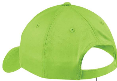
Adjustable hook and loop closure